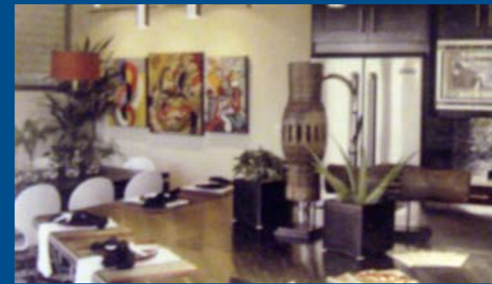
TOWN HOUSE B