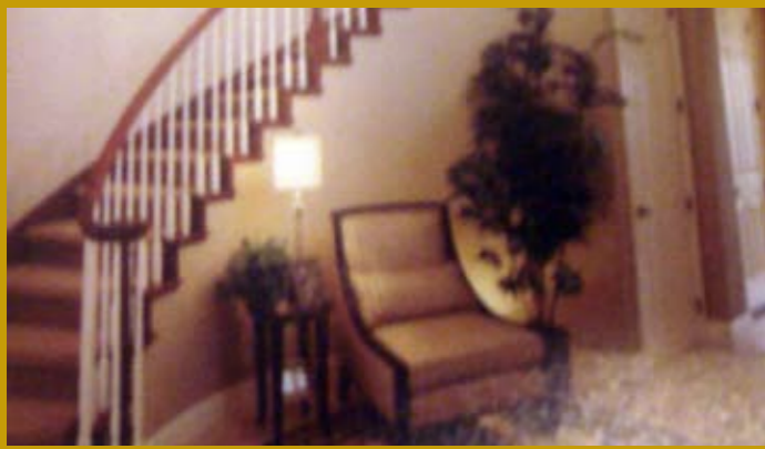
TOWN HOUSE A